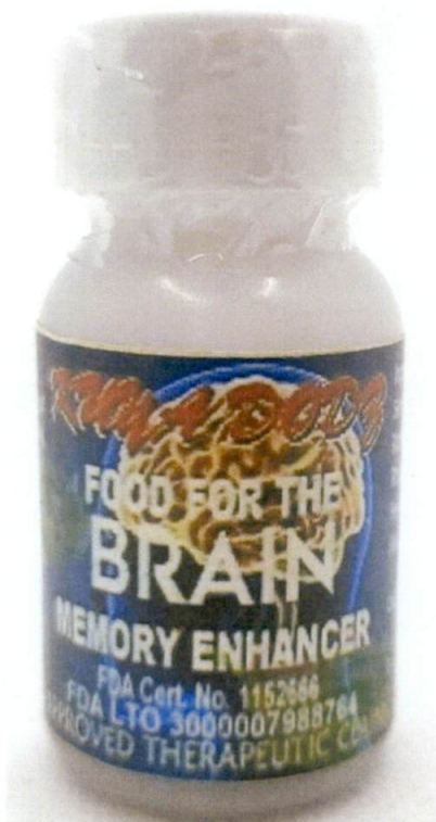
Figure 1. Unregistered KUYA DODZ Food for the Brain Memory Enhancer

The Food and Drug Administration (FDA) warns all healthcare professionals and the general public NOT TO PURCHASE AND CONSUME the unregistered food supplement: