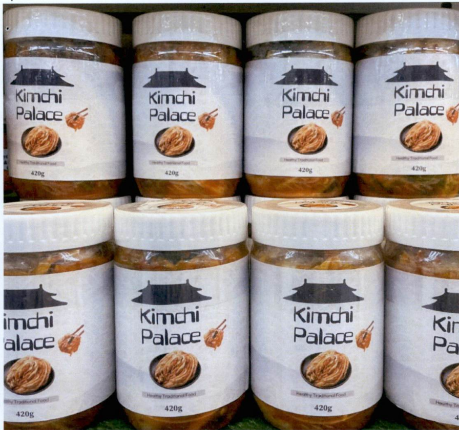
Figure 4. Unregistered KIMCHI PALACE Healthy Traditional Food

The FDA verified through online monitoring or post-marketing surveillance that the abovementioned food products are not registered and no corresponding Certificates of Product Registration (CPR) have been issued. Pursuant to the Republic Act No. 9711, otherwise known as the “Food and Drug Administration Act of 2009”, the manufacture, importation, exportation, sale, offering for sale, distribution, transfer, non-consumer use, promotion, advertising or sponsorship of health products without the proper authorization is prohibited.