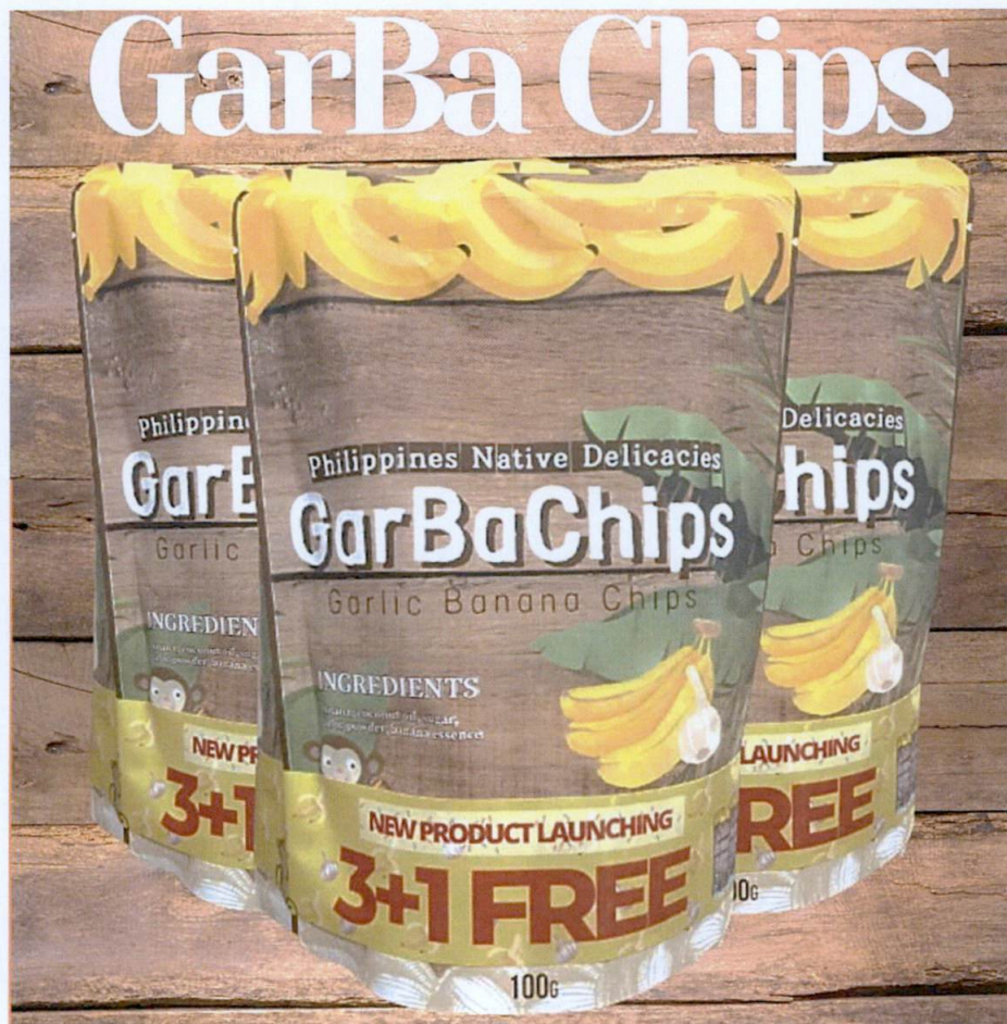
Figure 1. Unregistered GARBA CHIPS Garlic Banana Chips

The Food and Drug Administration (FDA) warns all healthcare professionals and the general public NOT TO PURCHASE AND CONSUME the following unregistered food products: