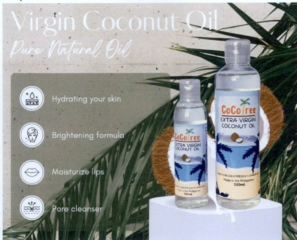
Figure 2. Unregistered COCO TREE Extra Virgin Coconut Oil