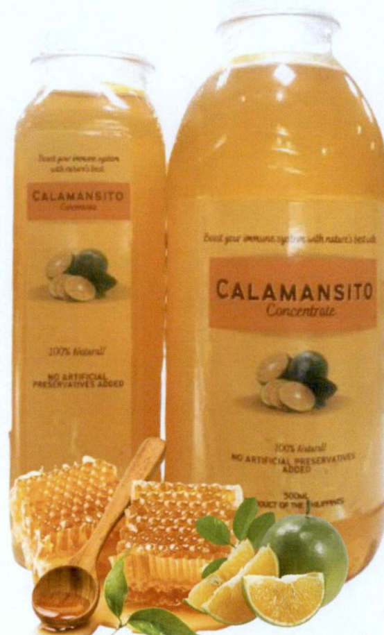
Figure 3. Unregistered CALAMANSITO Concentrate