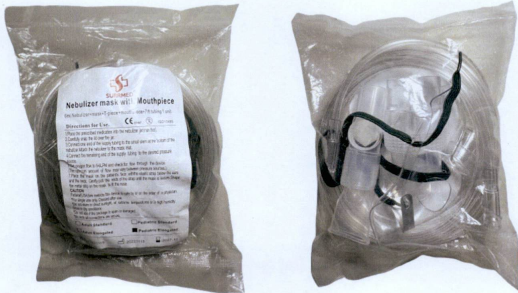
Figure 1. Unregistered Surmed® Nebulizer Mask with Mouthpiece - Pediatric Elongated

The Food and Drug Administration (FDA) warns all healthcare professionals and the general public NOT TO PURCHASE AND USE the unregistered medical device product: