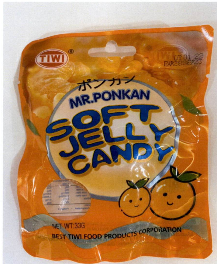
Figure 1. Unregistered TIWI Mr. Ponkan Soft Jelly Candy

The Food and Drug Administration (FDA) warns all healthcare professionals and the general public NOT TO PURCHASE AND CONSUME the unregistered food product: