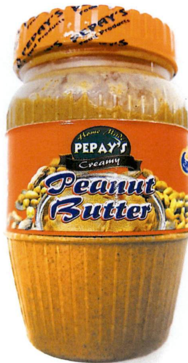
Figure 1. Unregistered HOME MADE PEPAY'S Creamy Peanut Butter

The Food and Drug Administration (FDA) warns all healthcare professionals and the general public NOT TO PURCHASE AND CONSUME the unregistered food product: