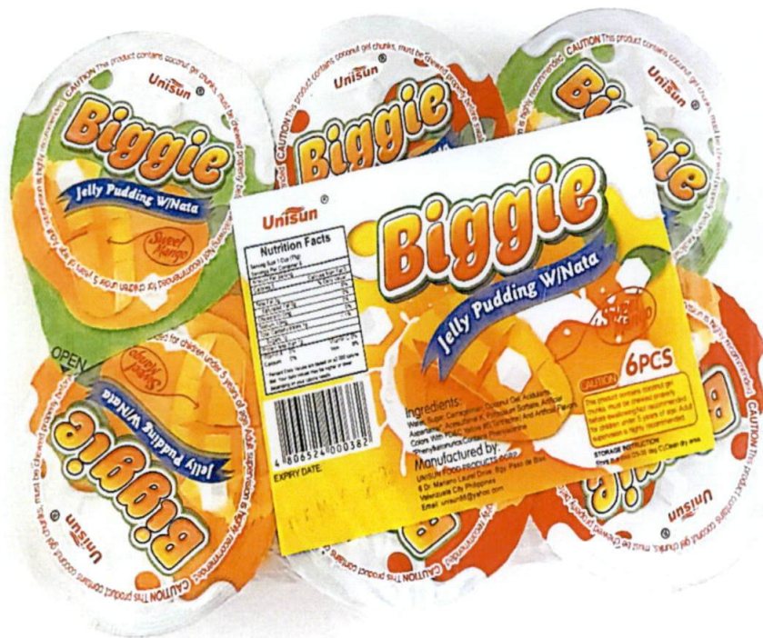
Figure 1. Unregistered BIGGIE Jelly Pudding w/ Nata Sweet Mango

The Food and Drug Administration (FDA) warns all healthcare professionals and the general public NOT TO PURCHASE AND CONSUME the unregistered food product: