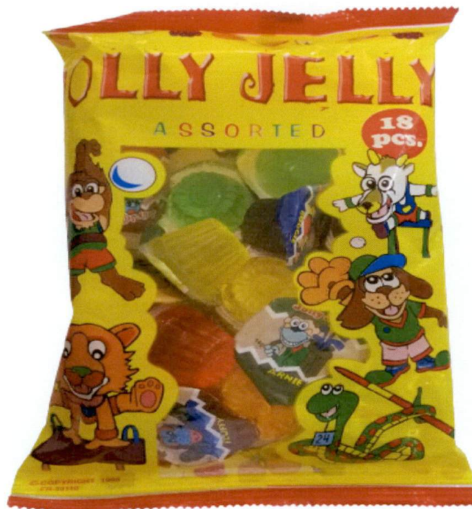
Figure 1. Unregistered JOLLY JELLY Assorted

The Food and Drug Administration (FDA) warns all healthcare professionals and the general public NOT TO PURCHASE AND CONSUME the unregistered food product: