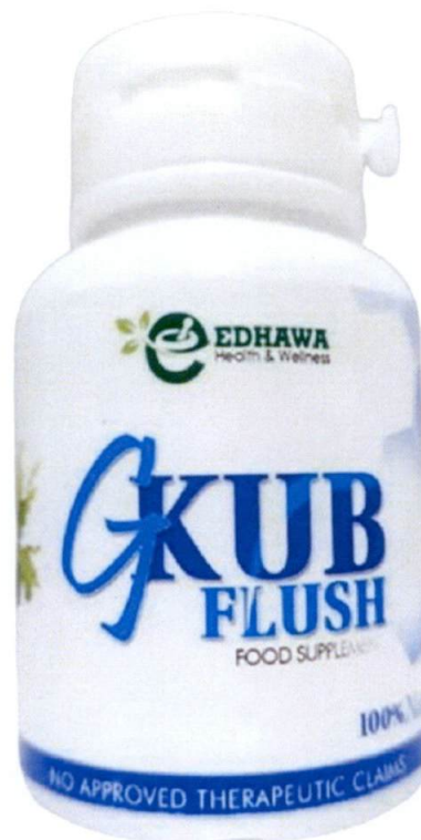
Figure 1. Unregistered EDHAWA HEALTH & WELLNESS GKUB Flush Food Supplement

The Food and Drug Administration (FDA) warns all healthcare professionals and the general public NOT TO PURCHASE AND CONSUME the unregistered food supplement: