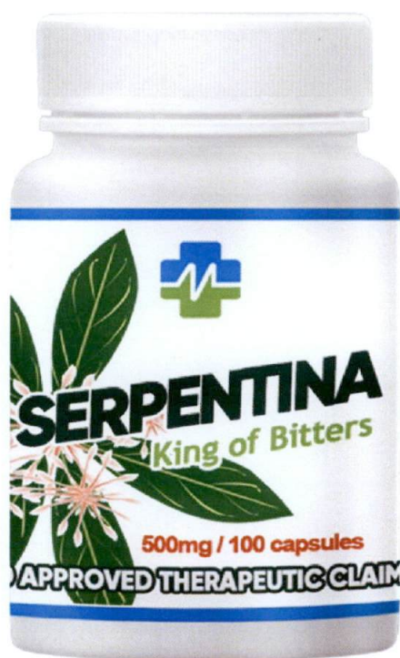
Figure 1. Unregistered Serpentina King of Bitters

The Food and Drug Administration (FDA) warns all healthcare professionals and the general public NOT TO PURCHASE AND CONSUME the unregistered food supplement: