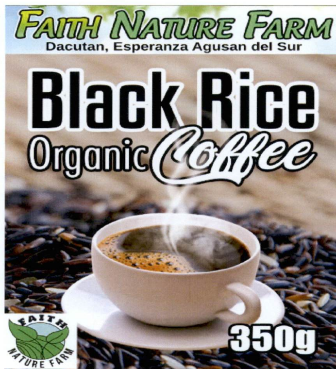
Figure 1. Unregistered FAITH NATURE FARM Black Rice Organic Coffee

The Food and Drug Administration (FDA) warns all healthcare professionals and the general public NOT TO PURCHASE AND CONSUME the unregistered food product: