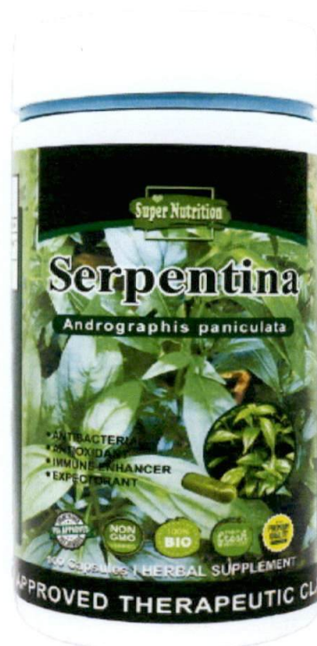
Figure 1. Unregistered SUPER NUTRITION Serpentina Herbal Supplement

The Food and Drug Administration (FDA) warns all healthcare professionals and the general public NOT TO PURCHASE AND CONSUME the unregistered food supplement: