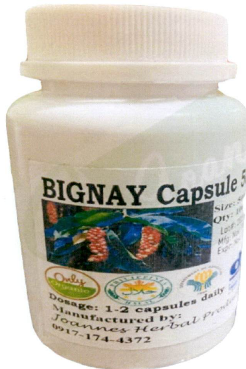
Figure 1. Unregistered UNBRANDED Bignay Capsule

The Food and Drug Administration (FDA) warns all healthcare professionals and the general public NOT TO PURCHASE AND CONSUME the unregistered food supplement: