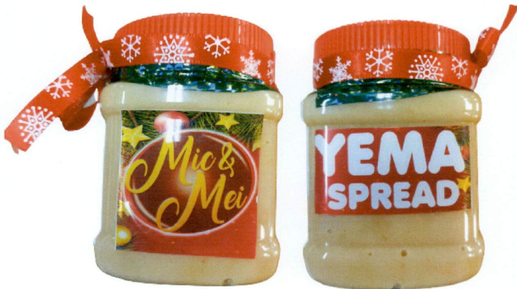
Figure 1. Unregistered MIC & MEI Yema Spread

The Food and Drug Administration (FDA) warns all healthcare professionals and the general public NOT TO PURCHASE AND CONSUME the unregistered food product: