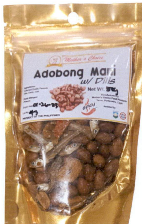
Figure 1. Unregistered MOTHER'S CHOICE Adobong Mani w/ Dilis Spicy

The Food and Drug Administration (FDA) warns all healthcare professionals and the general public NOT TO PURCHASE AND CONSUME the unregistered food product: