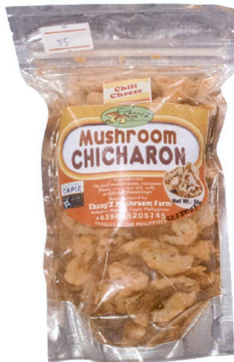
Figure 1. Unregistered EBANG'Z Mushroom Chicharon Chili Cheese

The Food and Drug Administration (FDA) warns all healthcare professionals and the general public NOT TO PURCHASE AND CONSUME the unregistered food product: