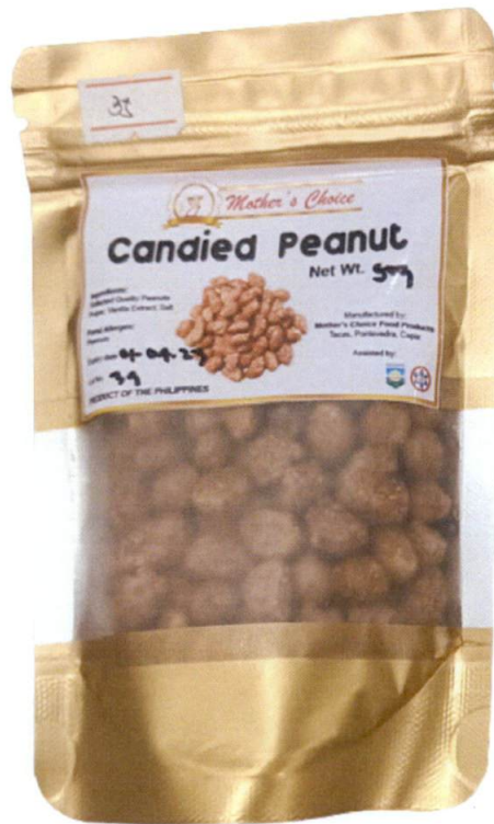
Figure 1. Unregistered MOTHER'S CHOICE Candied Peanut

The Food and Drug Administration (FDA) warns all healthcare professionals and the general public NOT TO PURCHASE AND CONSUME the unregistered food product: