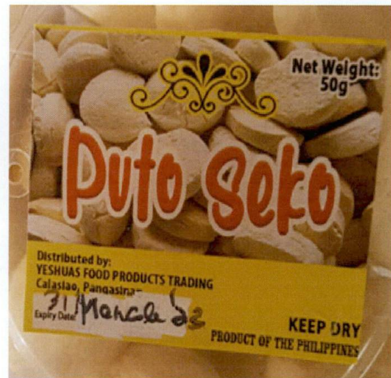
Figure 1. Unregistered UNBRANDED Puto Seko

The FDA verified through online monitoring or post-marketing surveillance that the abovementioned food product is not registered and no corresponding Certificate of Product Registration (CPR) has been issued. Pursuant to the Republic Act No. 9711, otherwise known as the “Food and Drug Administration Act of 2009”, the manufacture, importation, exportation, sale, offering for sale, distribution, transfer, non-consumer use, promotion, advertising or sponsorship of health products without the proper authorization is prohibited.