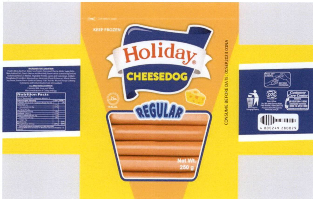
Figure 1. The approved label of HOLIDAY Cheesedog Regular with registration number under FR No. 4000010842753 issued on 20 March 2023 valid until 20 March 2028 .

The Food and Drug Administration (FDA) informs the public that the food product/ food supplement HOLIDAY Cheesedog Regular has been registered by the Market Authorization Holder (MAH) FOODSPHERE, INC. in accordance to existing FDA rules and regulations.