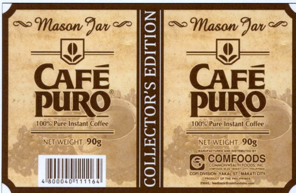
Figure 1. The approved label of CAFÉ PURO® Instant Pure Coffee with registration number FR- 4000007041398 issued on 04 November 2020 valid until 04 November 2025 .

The Food and Drug Administration (FDA) informs the public that the following food product is now registered by the Market Authorization Holder (MAH) COMMONWEALTH FOODS, INC. in accordance to existing FDA rules and regulations.