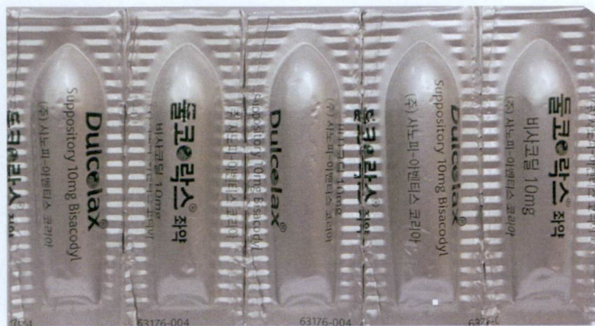
Dulcolax® Suppository 10mg Bisacodyl [Label in Foreign Language]