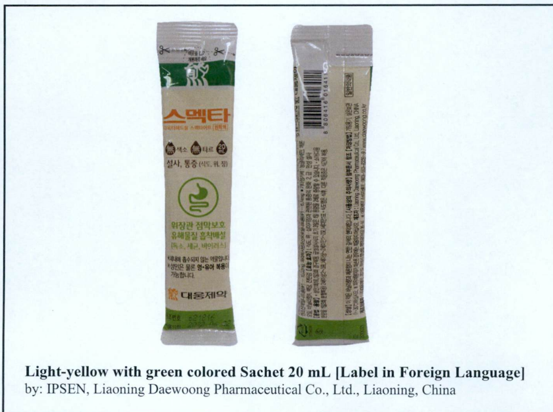
Light-yellow with green colored Sachet 20 mL [Label in Foreign Language] by: IPSEN, Liaoning Daewoong Pharmaceutical Co., Ltd., Liaoning, China

The Food and Drug Administration (FDA) advises the public against the purchase and use of the following unregistered drug products: