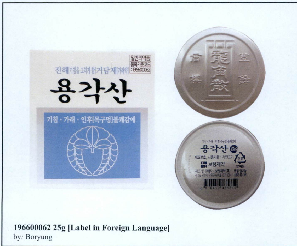
196600062 25g [Label in Foreign Language] by: Boryung

The Food and Drug Administration (FDA) advises the public against the purchase and use of the following unregistered drug products: