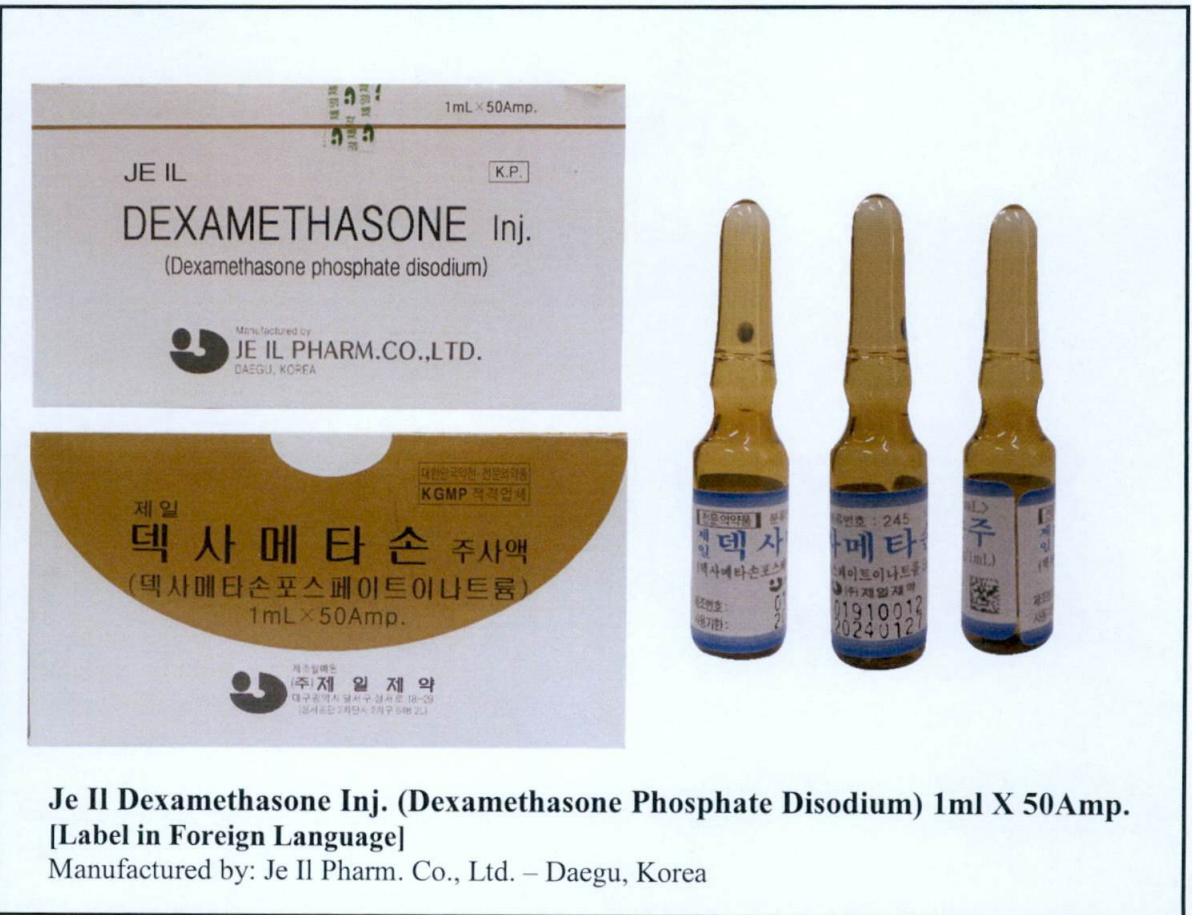
Je Il Dexamethasone Inj. (Dexamethasone Phosphate Disodium) 1ml X 50Amp. [Label in Foreign Language] Manufactured by: Je Il Pharm. Co., Ltd. – Daegu, Korea