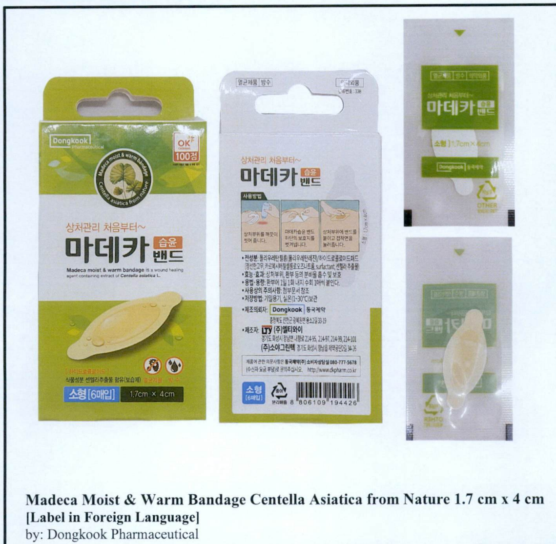
Figure 1: Unregistered drug product

The Food and Drug Administration (FDA) advises the public against the purchase and use of the unregistered drug product: