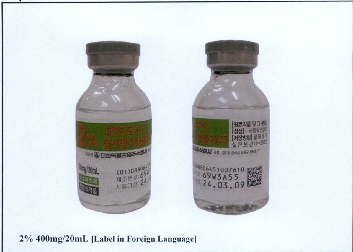
2% 400mg/20mL [Label in Foreign Language]