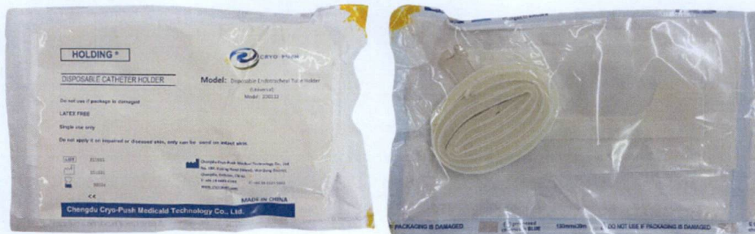
Figure 2. Unregistered Holding - Disposable Catheter Holder (Model: 220132)