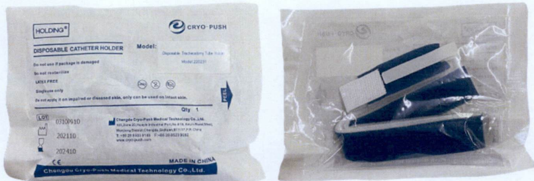
Figure 1. Unregistered Holding - Disposable Catheter Holder (Model: 220231)

The Food and Drug Administration (FDA) warns all healthcare professionals and the general public NOT TO PURCHASE AND USE the unregistered medical device products: