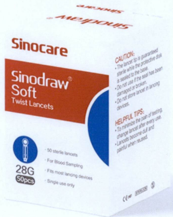
Figure 1. Unregistered Sinocare Sinodraw® Soft Twist Lancets advertised at Lazada.com.ph

The Food and Drug Administration (FDA) warns all healthcare professionals and the general public NOT TO PURCHASE AND USE the unregistered medical device product: