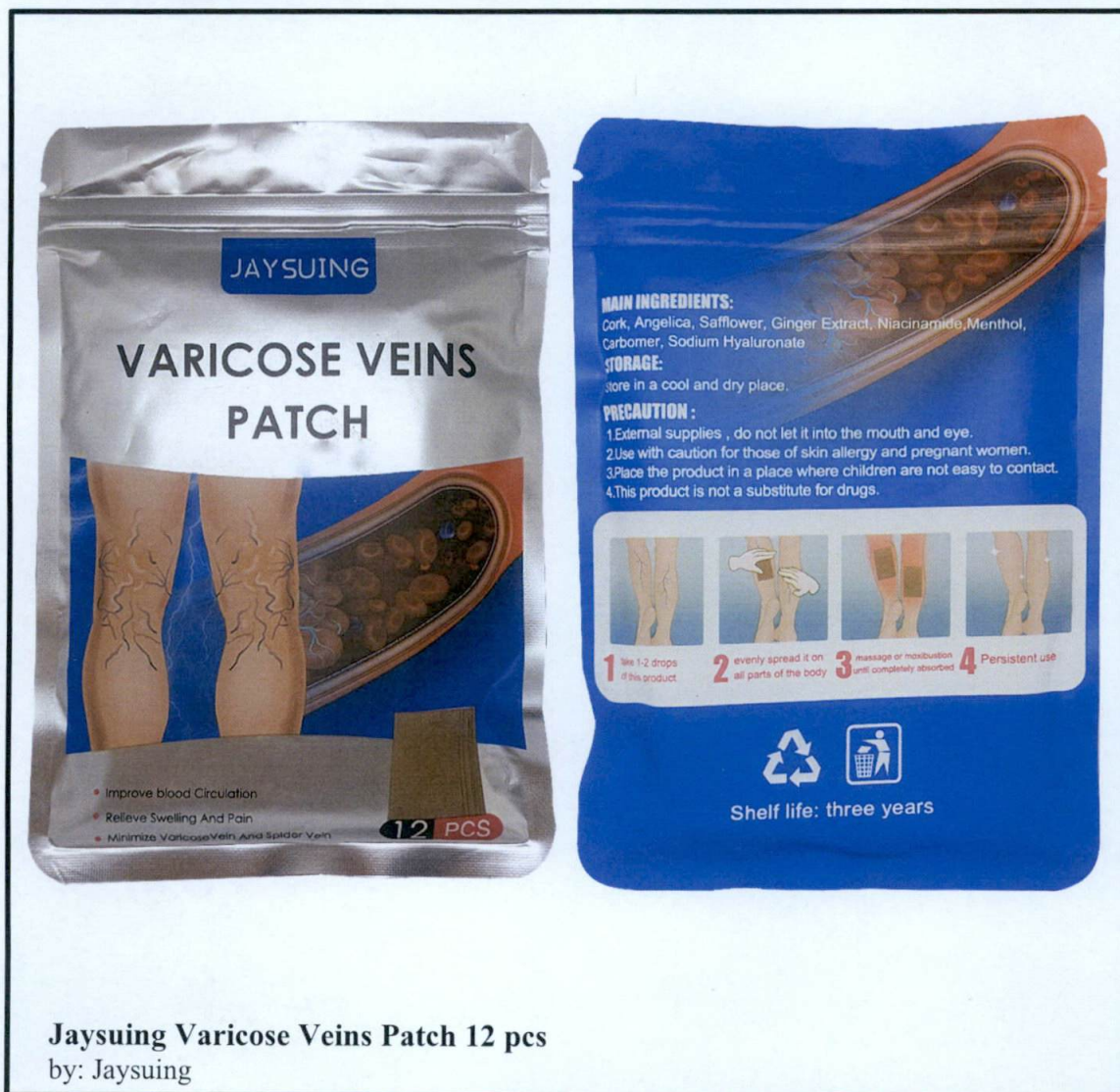
Figure 1: Unregistered drug product

The Food and Drug Administration (FDA) advises the public against the purchase and use of the unregistered drug product: