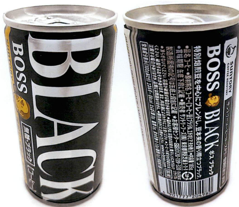
Figure 1. Unregistered SUNTORY BOSS Black Coffee

The Food and Drug Administration (FDA) warns all healthcare professionals and the general public NOT TO PURCHASE AND CONSUME the unregistered food product: