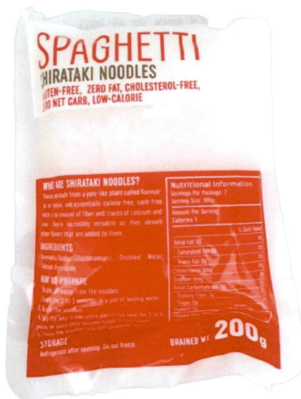
Figure 1. Unregistered SPAGHETTI Shirataki Noodles

The Food and Drug Administration (FDA) warns all healthcare professionals and the general public NOT TO PURCHASE AND CONSUME the unregistered food product: