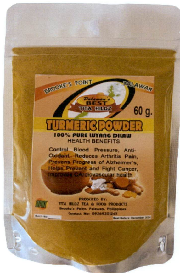
Figure 1. Unregistered PALAWAN'S BEST TITA HILDZ Turmeric Powder 100% Pure Luyang Dilaw

The Food and Drug Administration (FDA) warns all healthcare professionals and the general public NOT TO PURCHASE AND CONSUME the unregistered food product: