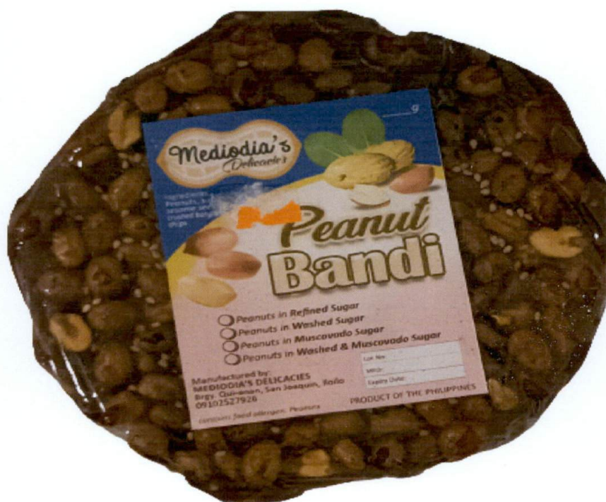
Figure 1. Unregistered MEDIODIA'S DELICACIES Peanut Bandi

The Food and Drug Administration (FDA) warns all healthcare professionals and the general public NOT TO PURCHASE AND CONSUME the unregistered food product: