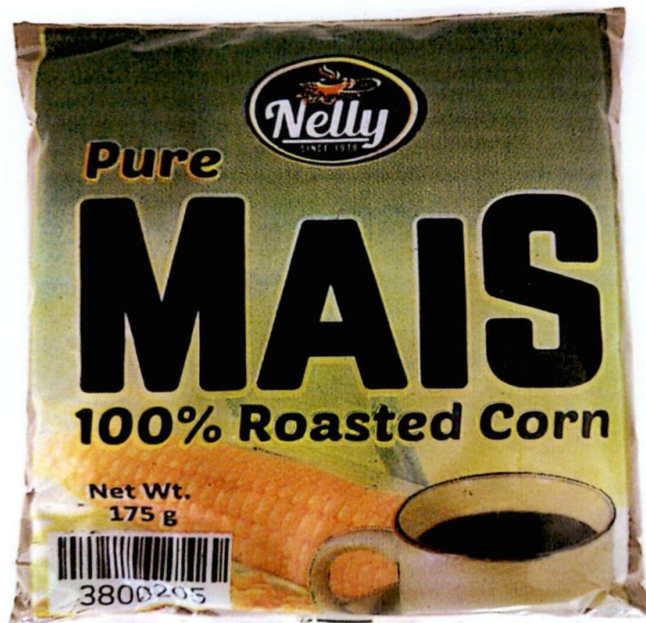
Figure 1. Unregistered NELLY Pure Mais 100% Roasted Corn

The Food and Drug Administration (FDA) warns all healthcare professionals and the general public NOT TO PURCHASE AND CONSUME the unregistered food product: