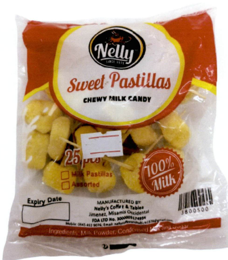
Figure 1. Unregistered NELLY Sweet Pastillas - Chewy Milk Candy

The Food and Drug Administration (FDA) warns all healthcare professionals and the general public NOT TO PURCHASE AND CONSUME the unregistered food product: