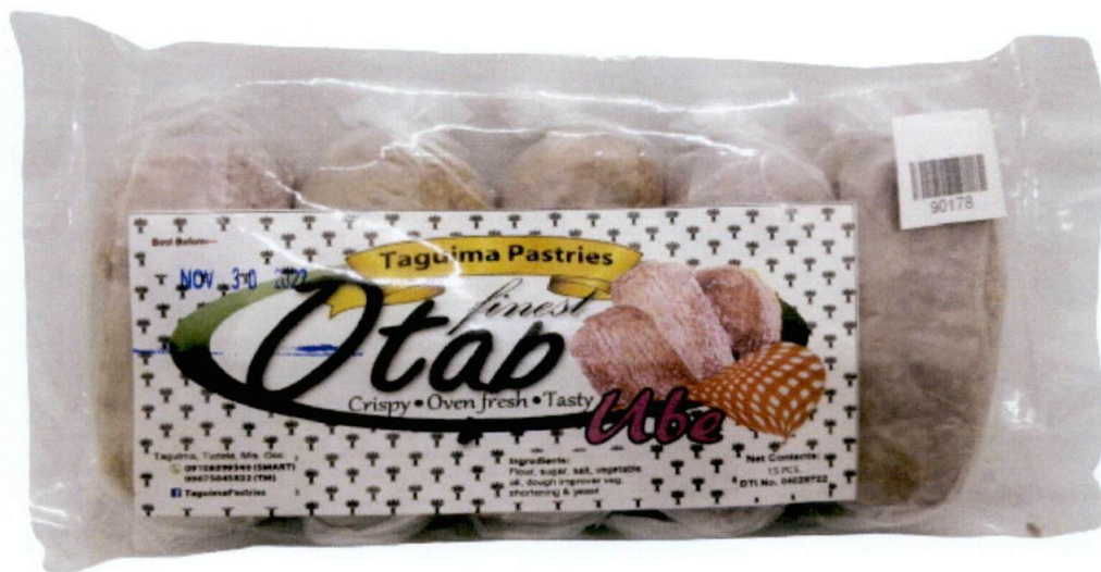
Figure 1. Unregistered TAGUIMA PASTRIES Finest Otap - Ube

The Food and Drug Administration (FDA) warns all healthcare professionals and the general public NOT TO PURCHASE AND CONSUME the unregistered food product: