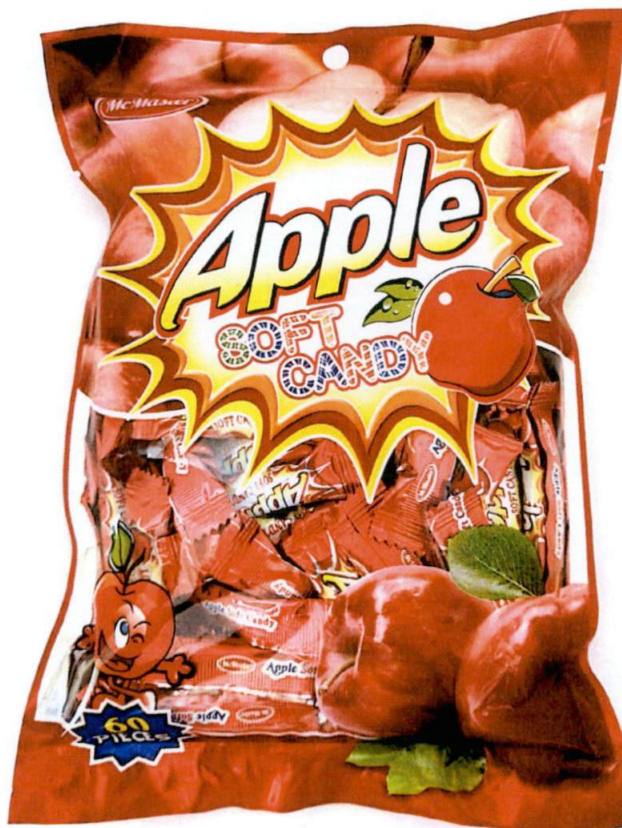
Figure 1. Unregistered MCMaster Apple Soft Candy

The Food and Drug Administration (FDA) warns all healthcare professionals and the general public NOT TO PURCHASE AND CONSUME the unregistered food product: