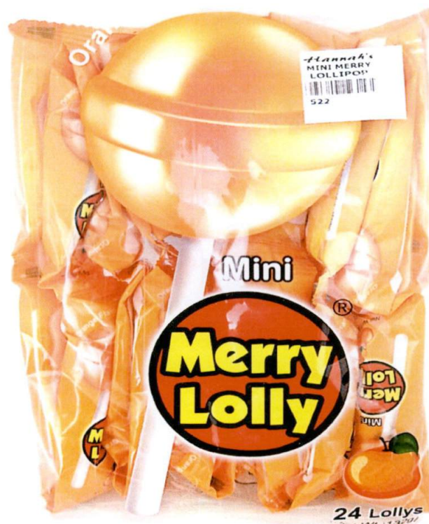
Figure 1. Unregistered HANNAH'S Mini Merry Lollipop (Mini Merry Lolly)

The Food and Drug Administration (FDA) warns all healthcare professionals and the general public NOT TO PURCHASE AND CONSUME the unregistered food product: