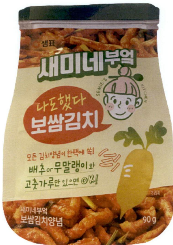
Figure 1. Unregistered (IN FOREIGN LANGUAGE) Product in Red and Green Pouch with Carrots and Kimchi Picture (In foreign language)

The Food and Drug Administration (FDA) warns all healthcare professionals and the general public NOT TO PURCHASE AND CONSUME the unregistered food product: