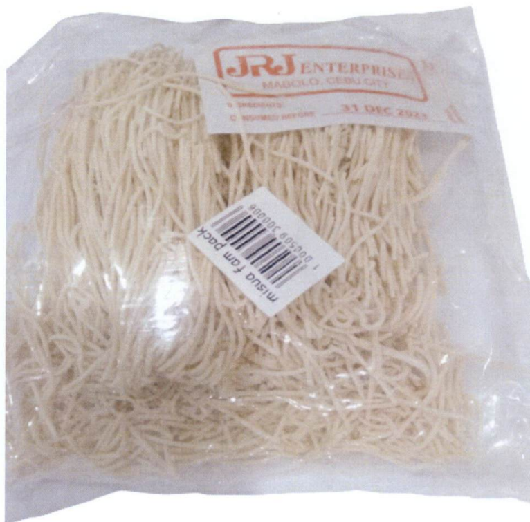
Figure 1. Unregistered JRJ ENTERPRISES Misua Fam Pack

The Food and Drug Administration (FDA) warns all healthcare professionals and the general public NOT TO PURCHASE AND CONSUME the unregistered food product: