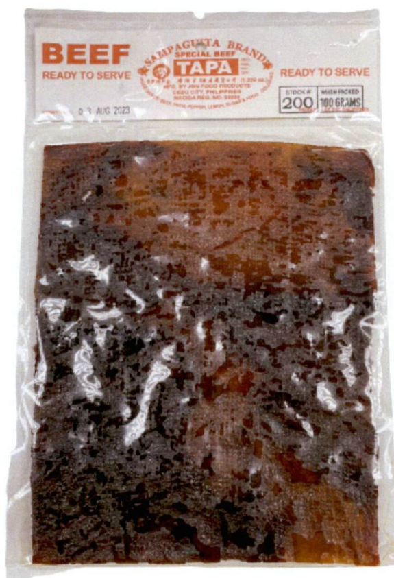
Figure 1. Unregistered SAMPAGUITA BRAND Special Beef Tapa

The Food and Drug Administration (FDA) warns all healthcare professionals and the general public NOT TO PURCHASE AND CONSUME the unregistered food product: