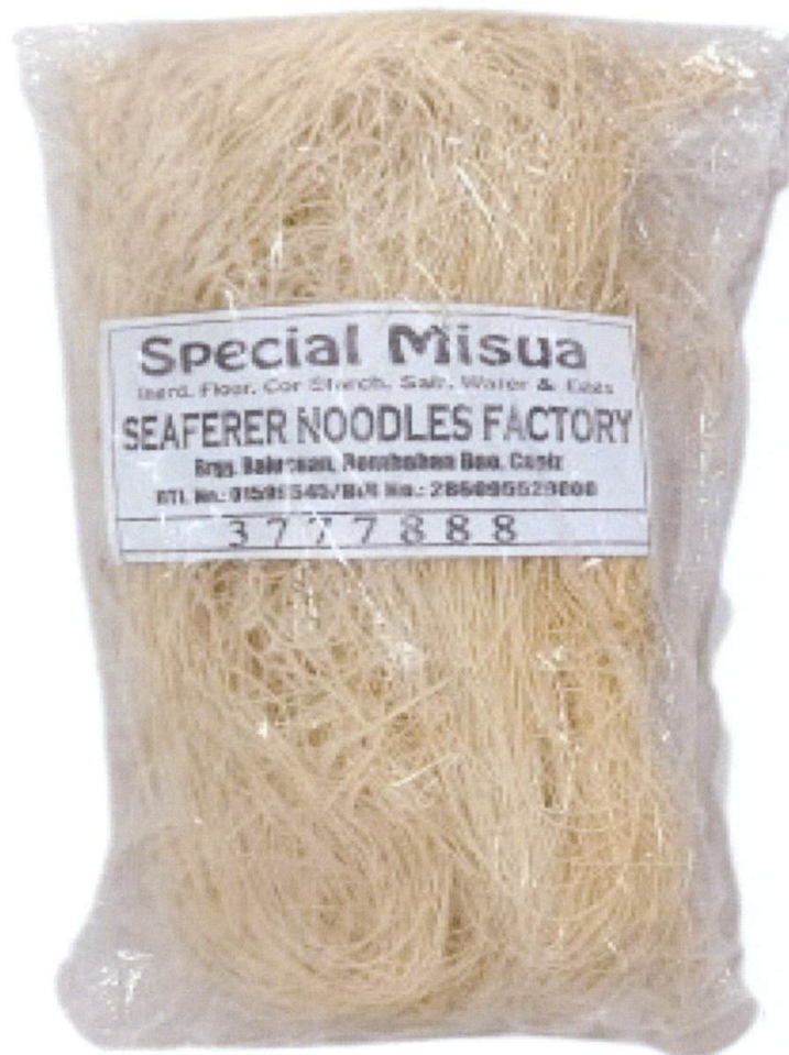
Figure 1. Unregistered SEAFERER NOODLES FACTORY Special Misua

The Food and Drug Administration (FDA) warns all healthcare professionals and the general public NOT TO PURCHASE AND CONSUME the unregistered food product: