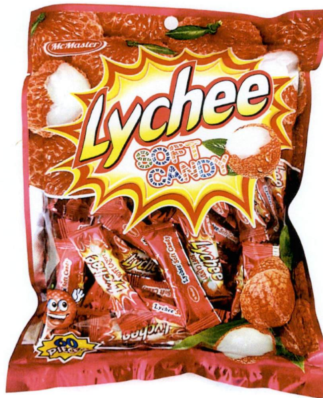
Figure 1. Unregistered MCMASTER Lychee Soft Candy

The Food and Drug Administration (FDA) warns all healthcare professionals and the general public NOT TO PURCHASE AND CONSUME the unregistered food product: