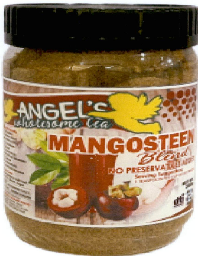
Figure 1. Unregistered ANGEL'S WHOLESOME TEA Mangosteen Blend

The Food and Drug Administration (FDA) warns all healthcare professionals and the general public NOT TO PURCHASE AND CONSUME the unregistered food product: