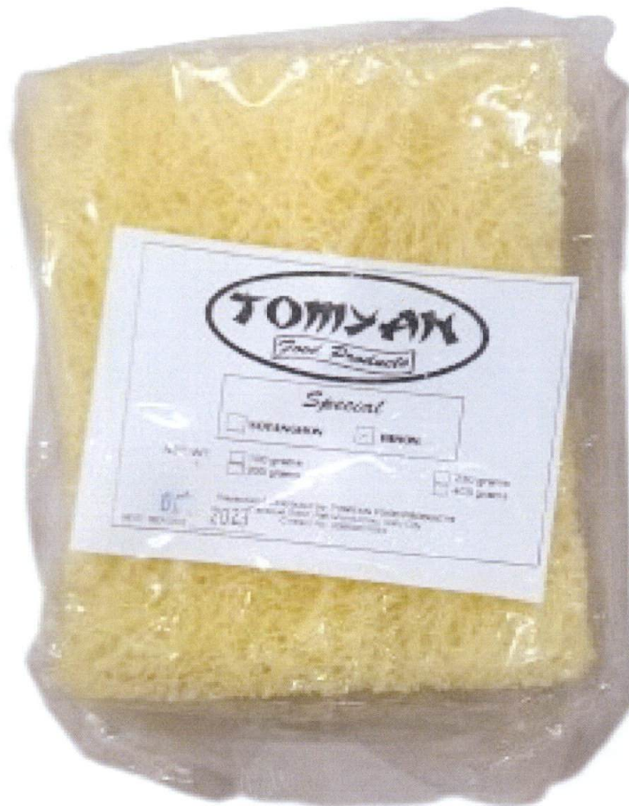
Figure 1. Unregistered TOMYAN FOOD PRODUCTS Special Bihon

The Food and Drug Administration (FDA) warns all healthcare professionals and the general public NOT TO PURCHASE AND CONSUME the unregistered food product: