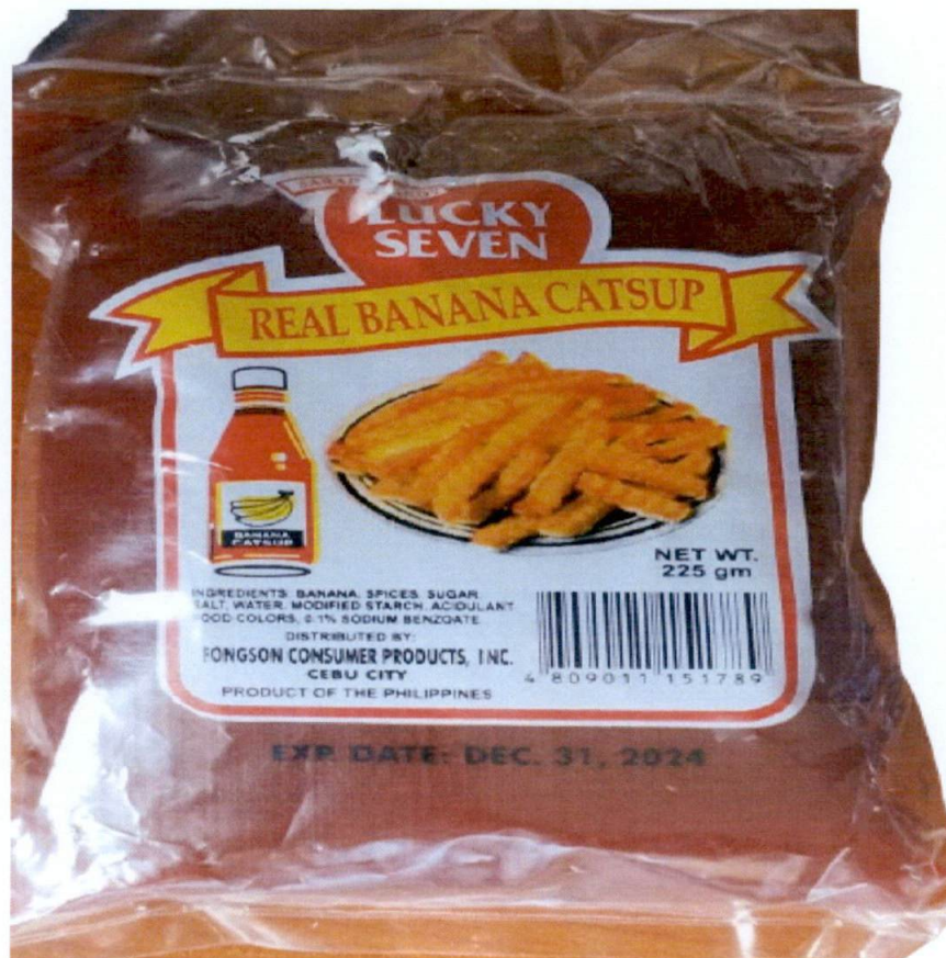
Figure 1. Unregistered LUCKY SEVEN Real Banana Catsup

The Food and Drug Administration (FDA) warns all healthcare professionals and the general public NOT TO PURCHASE AND CONSUME the unregistered food product: