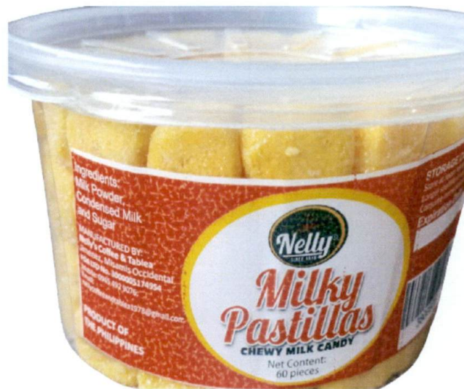
Figure 1. Unregistered NELLY Milky Pastillas Chewy Milk Candy

The Food and Drug Administration (FDA) warns all healthcare professionals and the general public NOT TO PURCHASE AND CONSUME the unregistered food product: