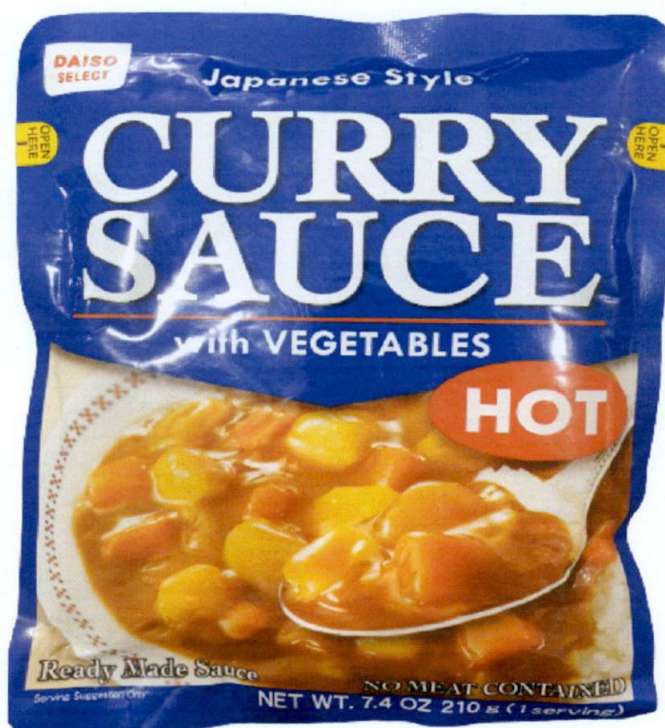
Figure 1. Unregistered DAISO SELECT Japanese Style Curry Sauce with Vegetables Hot - Ready Made Sauce

The Food and Drug Administration (FDA) warns all healthcare professionals and the general public NOT TO PURCHASE AND CONSUME the unregistered food product: