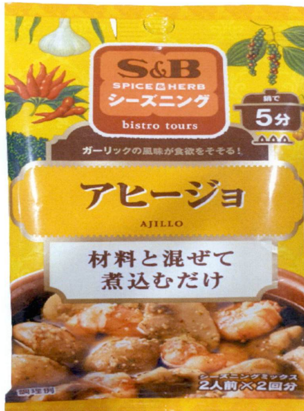
Figure 1. Unregistered S&B SPICE & HERB Ajillo

The Food and Drug Administration (FDA) warns all healthcare professionals and the general public NOT TO PURCHASE AND CONSUME the unregistered food product: