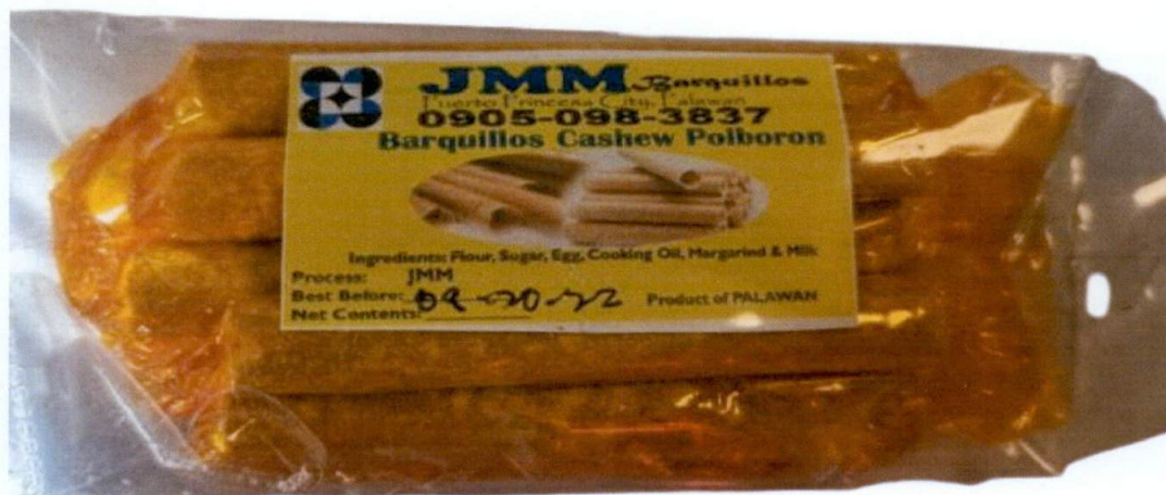
Figure 1. Unregistered JMM BARQUILLOS Barquillos Cashew Polboron

The Food and Drug Administration (FDA) warns all healthcare professionals and the general public NOT TO PURCHASE AND CONSUME the unregistered food product: