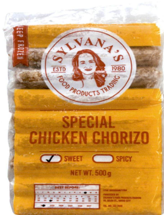
Figure 1. Unregistered SYLVANA'S FOOD PRODUCTS TRADING Special Chicken Chorizo Sweet

The Food and Drug Administration (FDA) warns all healthcare professionals and the general public NOT TO PURCHASE AND CONSUME the unregistered food product: