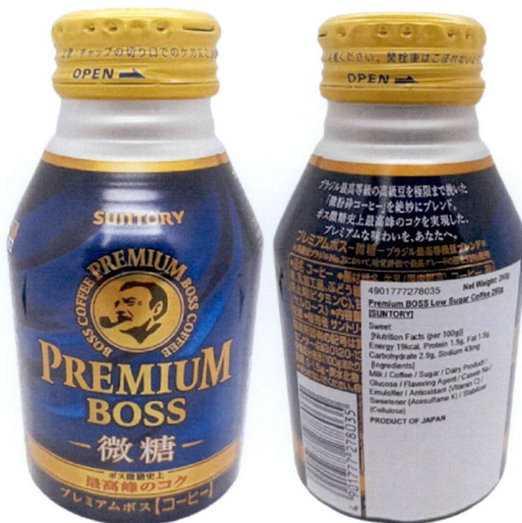
Figure 1. Unregistered SUNTORY PREMIUM BOSS LOW SUGAR COFFEE

The Food and Drug Administration (FDA) warns all healthcare professionals and the general public NOT TO PURCHASE AND CONSUME the unregistered food product: