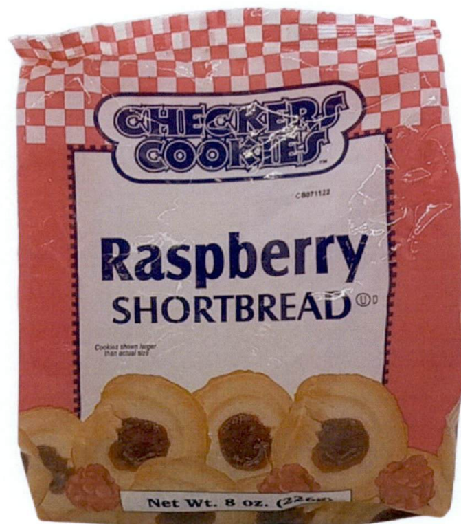
Figure 1. Unregistered CHECKERS COOKIES RASPBERRY SHORTBREAD

The Food and Drug Administration (FDA) warns all healthcare professionals and the general public NOT TO PURCHASE AND CONSUME the unregistered food product: